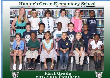
Class Portrait Sample