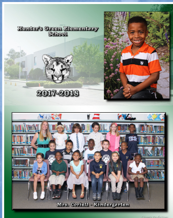
Memory Mate Sample

You can also preorder online at giganteproductions.com Click the "Preorder My Spring Portraits" Button and select your student's school